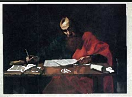
St. Paul writing his letters

The first celebration opportunity is our LMM sponsored Mission Festival on Sunday, October 5, noon to 2 p.m., at Calvary Lutheran Church. Many fellow Lutherans will be present to share how they are reaching out