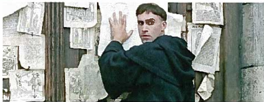
Nailing the 95 Theses, from the movie "Luther"

A time of fellowship will follow the service with light refreshment provided by Lutheran Multicultural Mission. Visitors also may wish to explore Holy Cross as they expand their facility to develop their Lutheran school.